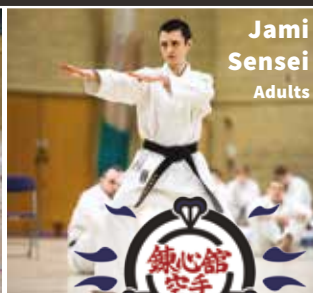
Jami Sensei Adults